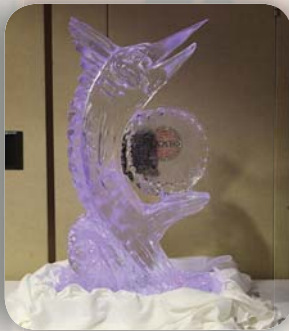
Ice sculpture commemorating ceremony in Ocean City, MD - The White Marlin Capital of the World