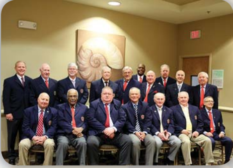
The IAABO Past Presidents Club