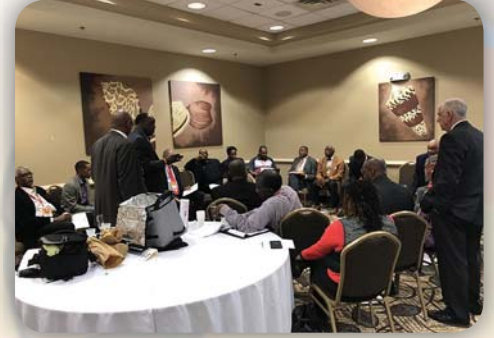
Meeting of the Black Caucus