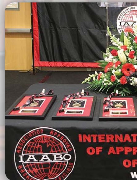
Life Member Awards that was on display

The honorees spoke of the friends and fellow IAABO members that made it possible for them to receive this award.