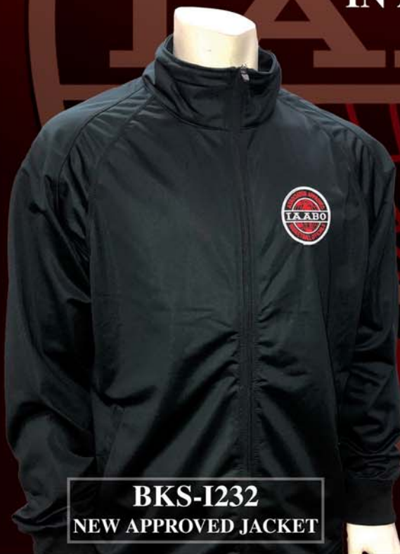
BKS-I232 NEW APPROVED JACKET

MADE IN USA DYE SUBLIMATED IAABO SHIRTS IN ALL STYLES