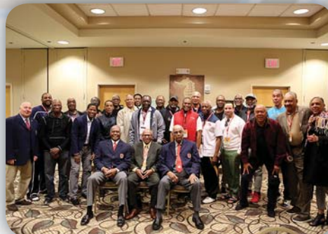
The IAABO Black Caucus