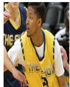
ILLEGAL - color