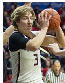
ILLEGAL - color